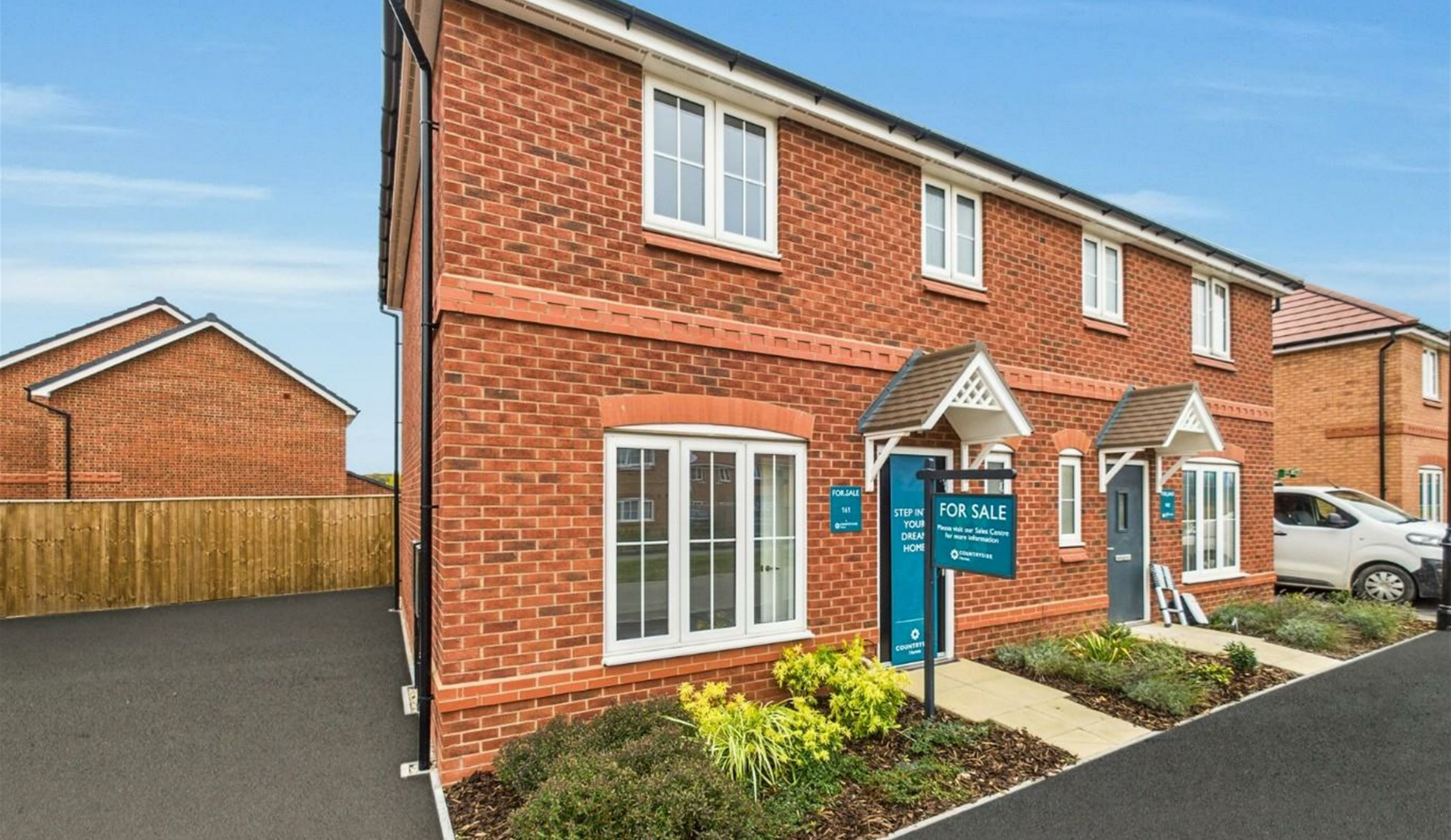
Home 161 - Swan Grange, Witham St. Hughes, LN6 9US